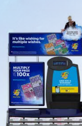
Counter Units with Lug-On