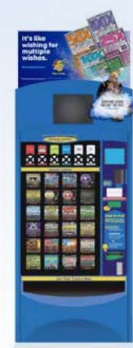
Vending Topper & Lug-On