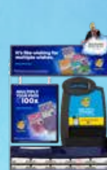
Counter Units with Lug-On

Make sure to keep all Multiplier POS posted until the Holiday POS is delivered. #MultipleSales