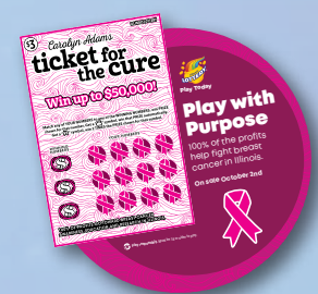
Ticket for the Cure Aisle Violator