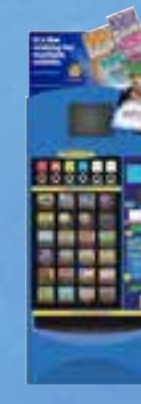
Vending Topper & Wobbler