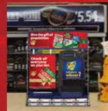
Horizontal Counter Unit