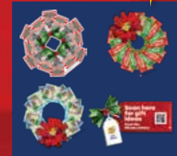
Vending Decals (Place on Vending Machine)