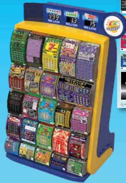
MAXIMUM SALES DRIVER

Displaying instant tickets on the counter will increase awareness and encourage consumers to purchase lottery tickets at your store.