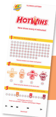
Player makes their wager using a playslip or audibly calls out their wager to retailer