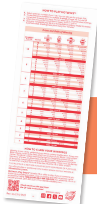
Odds and prizes can be referenced on reverse side of playslip