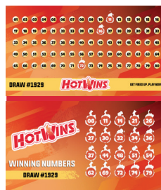
Player views relevant draw(s) to determine if they are a winner.