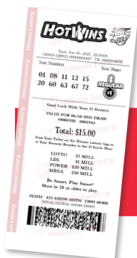
Player receives a ticket based on their wager selection for the next available draw(s)