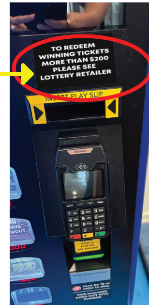
After Completed Replacement

As a reminder, pursuant to the IDL-61 Retailer Agreement for Sale of Lottery Tickets, the Illinois Department of Lottery and Allwyn Illinois LLC shall not be liable for any retailer's or retailer employee's failure to correctly place the reinvestment update stickers on a Win30 or DTS vending machine in a timely manner.