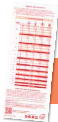
Odds and prizes can be referenced on reverse side of playslip