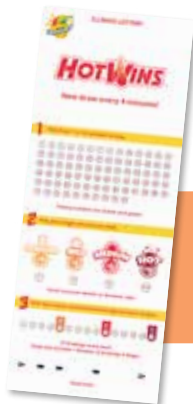
Player makes their wager using a playslip or audibly calls out their wager to retailer