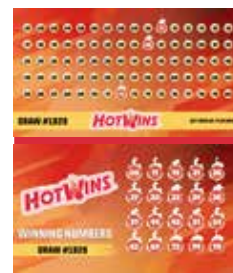
Player views relevant draw(s) to determine if they are a winner.