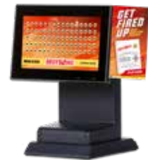
Player scans ticket at the ticket checker to confirm their win. The retailer will validate their win and award them their prize funds, depending on the amount. If the prize is $600 or over, the player must visit a Claims Center.

THE Lottery NOVEMBER-DECEMBER 2025 LOWDOWN