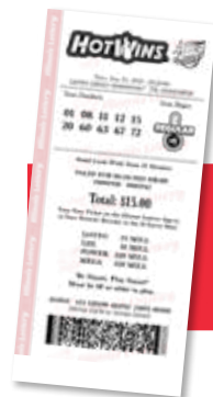
Player receives a ticket based on their wager selection for the next available draw(s)