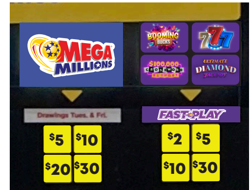
AFTER COMPLETED REPLACEMENT