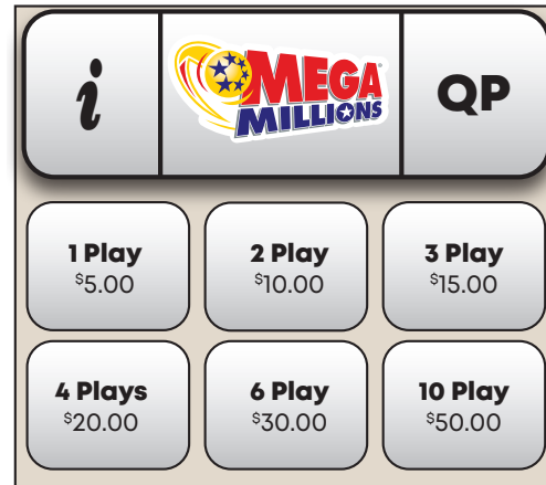
Figure 2: Quick Pick screen

Win30 Vending Machine: There will be no changes to Win30 reporting, but there will be various changes to the Win30 user (i.e., player) interface. There are currently two Mega Millions selections on the “Quick Pick” area at the top of the machine. The first Mega Millions Quick Pick selection will remain Mega Millions, and the card will be changed out to display a new blue card with the updated Mega Millions logo. The second selection will be changed to a Fast Play Quick Pick selection, and the card will be changed out to display a purple card with (4) Fast Play games from which players can choose. The price button stickers on both the Mega Millions Quick Pick option and the new Fast Play Quick Pick option will also be changing. It will be the responsibility of the retailer to make these sticker updates to the Win30. The new price stickers and placement instructions will be placed in the April new ticket shipments, which will be sent directly to stores with the new instant tickets that you receive every month. Please make sure the new price stickers are placed on the Win30 vending machines AFTER the Mega Millions draw on April 4, 2025. As a reminder, pursuant to the IDL-61 Retailer Agreement for Sale of Lottery Tickets, the Illinois Department of Lottery and Allwyn Illinois LLC shall not be liable for any retailer’s or retailer employee’s failure to correctly place the Mega Millions® update stickers on a Win30 in a timely manner.