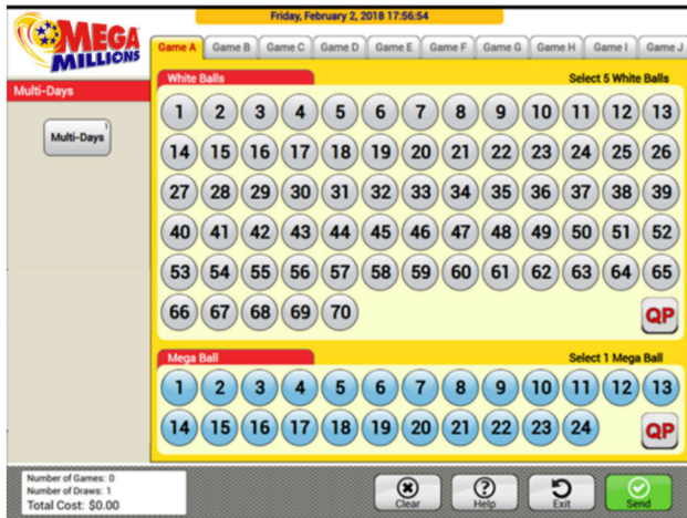
Figure 1: Mega Ball pick numbers screen

Photon Terminal: There will be no changes to the selling steps on the Photon terminal. However, you will notice a few changes and updates on the Photon screens. The base price button will be displayed as $5, an increase from $2; the Mega Ball pick numbers screen will be reduced from 25 to 24 numbers ( see Figure 1 ); and the Quick Pick option will be updated to reflect the new prices ( see Figure 2 ).