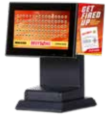
Player scans ticket at the ticket checker to confirm their win. The retailer will validate their win and award them their prize funds, depending on the amount. If the prize is $600 or over, the player must visit a Claims Center.

THE Lottery NOVEMBER-DECEMBER 2025 LOWDOWN