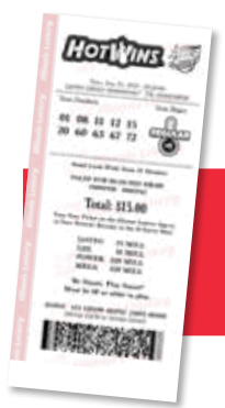
Player receives a ticket based on their wager selection for the next available draw(s)