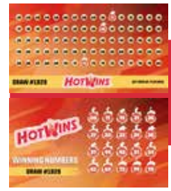
Player views relevant draw(s) to determine if they are a winner.