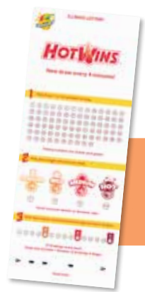
Player makes their wager using a playslip or audibly calls out their wager to retailer