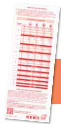
Odds and prizes can be referenced on reverse side of playslip