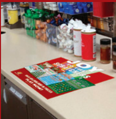
Beverage Counter Decal